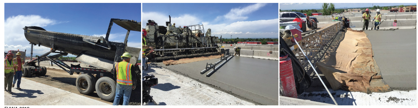
FHWA 2018 Figure 4. Concrete placement, finishing, and texturing of C-470