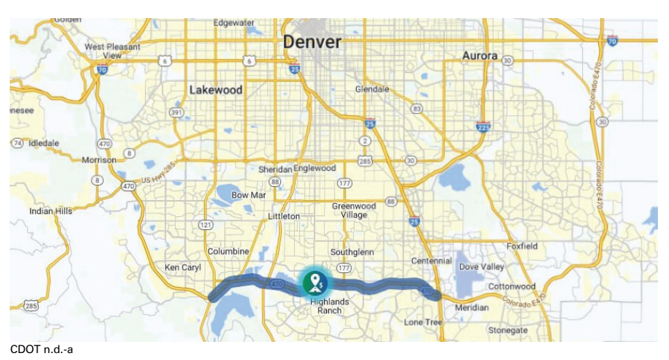
Figure 1. Project location