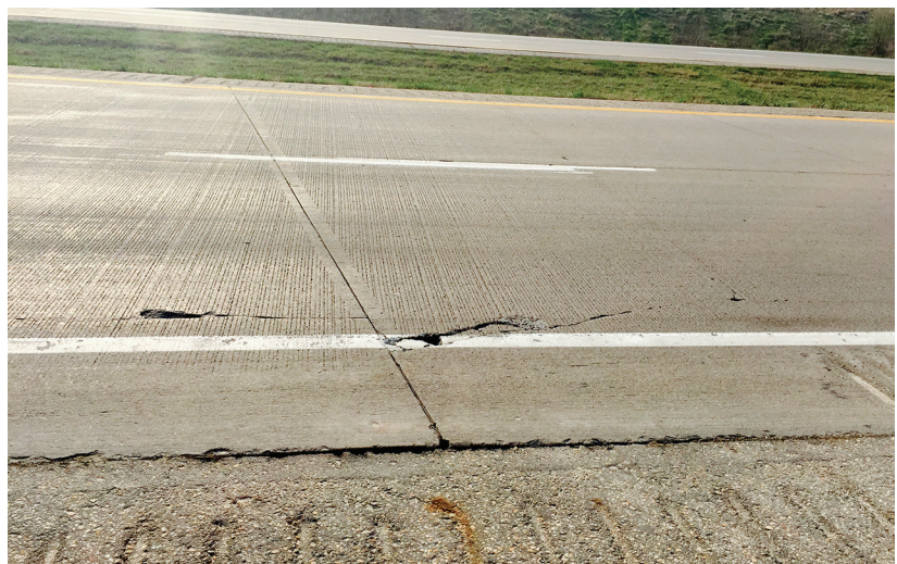
Longitudinal cracking observed in widened concrete pavement with a skewed transverse joint on US-65 in Polk County, Iowa

This distress pattern has never been reported before in Iowa, and an investigative study was needed to better understand the causes of this distress pattern. Although there is strong evidence for the occurrence of random longitudinal cracking in JPCPs in many states, few studies have documented the causative factors and prevention or mitigation strategies.