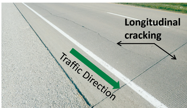
Longitudinal cracking observed on IA-163 with widened slabs in Mahaska County, Iowa

Concrete core samples were taken by Iowa Department of Transportation (DOT) crews at six of the longitudinal cracking locations.