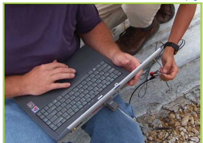
Figure 1. Measuring in-place maturity