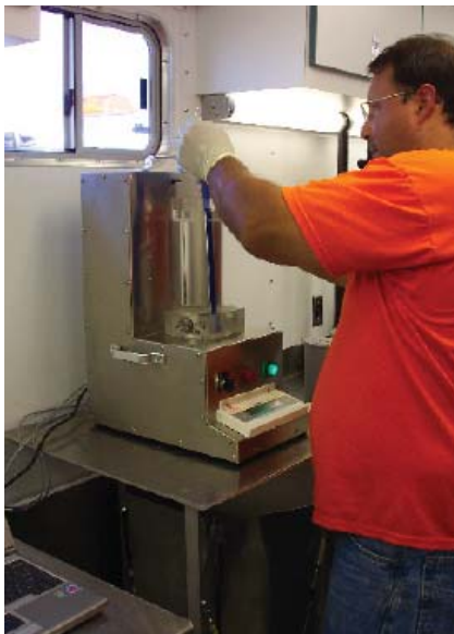
Research technician performing a test using the AVA on the isolation base

With the timely additional information obtained through AVA testing, improvements in spacing factor can be made by increasing the dosage of air entraining agent or water reducer, by using a different air entraining agent or water reducer, or by changing from an ordinary water reducer to a midrange water reducer (at a higher dosage).