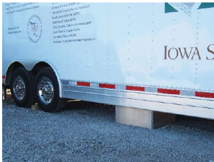
View of the weather shield from the exterior of the CP Tech Center Mobile Concrete Research Lab